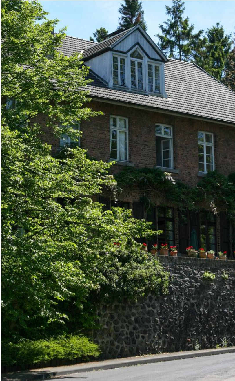
Old School, Königswinter